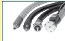
Heated extraction pipe