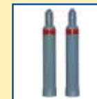
Test gas bottle