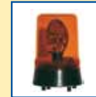
Rotating mirror lamp