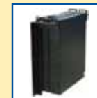
Mains Stand-by supply unit