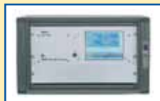
Pollution control computer