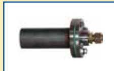
Mounting stubs with single flange