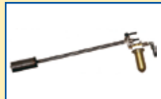
Sampled gas extraction